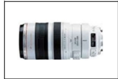
!XI 100 -400mm